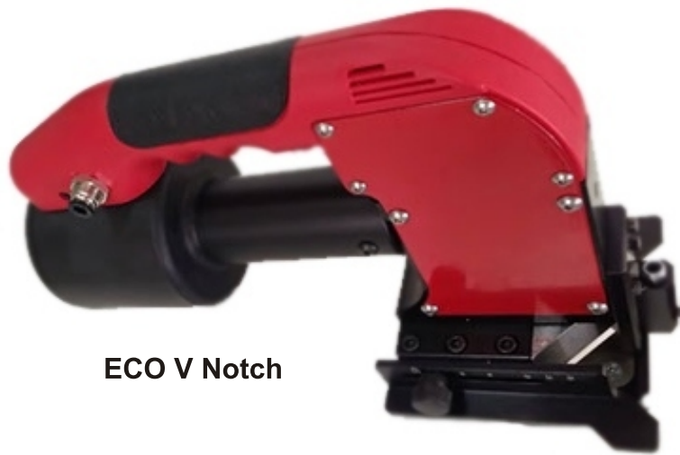
ECO V Notch